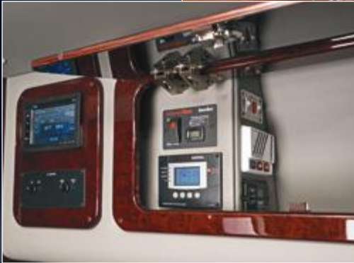
Systems Control Area