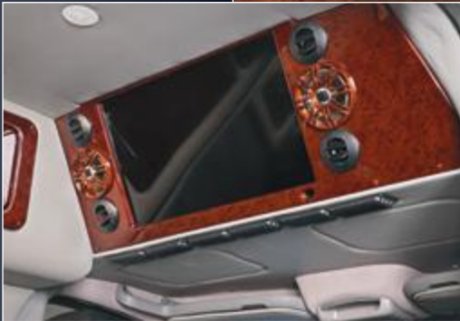
12V Heat/AC System